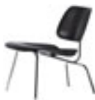
Eames Molded Plywood Lounge Chair