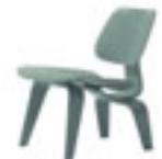
Eames Molded Plywood Lounge Chair