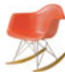
Eames Molded Plastic Armchair with Rocker Base