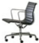
Eames Aluminum Group Management Chair

This device was their version of a curing oven. It let them create their own plywood and give it shape by using a bicycle pump to inflate a rubber membrane that pushed glued plies of wood against a curved, electrically heated plaster mold. The humble machine eventually allowed the Eameses to manufacture their molded plywood chair, named the Best Design of the 20th Century by Time magazine.