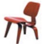
Eames Molded Plywood Lounge Chair