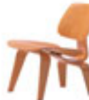
Eames Molded Plywood Lounge Chair