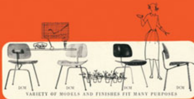
VARIETY OF MODELS AND FINISHES FIT MANY PURPOSES