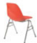
Eames Molded Plastic Side Chair

The products above are among the original modern classics still manufactured today and available through Herman Miller.