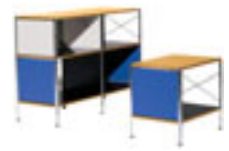
Eames Storage Units

The products above are among the original modern classics still manufactured today and available through Herman Miller.