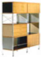
Eames® Storage Unit

We believe furniture becomes classic when it demonstrates a lasting appeal, an original personality, and a simple, innovative beauty and function. Classics are living proof that good things endure; they have a way of evoking a particular time and making time irrelevant. Committees and corporations don't design classics. Individuals like Charles Eames and George Nelson and Isamu Noguchi do. Their view of modern design lies at the heart of Herman Miller's collection of modern classics.