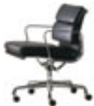
Eames Soft Pad Management Chair