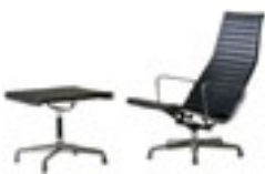
Eames Aluminum Group Lounge Chair and Ottoman