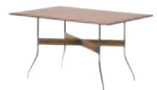
Nelson Swag Leg Table

The products above are among the original modern classics still manufactured today and available through Herman Miller.