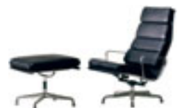
Eames Soft Pad Lounge Chair and Ottoman