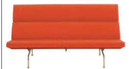
Eames Sofa Compact

The products above are among the original modern classics still manufactured today and available through Herman Miller.