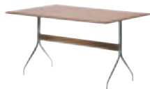
Nelson Swag Leg Work Table