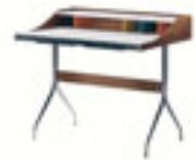
Nelson™ Swag Leg Desk