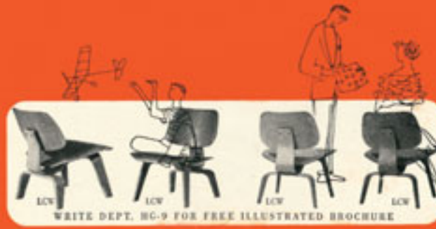
WRITE DEPT. HG-9 FOR FREE ILLUSTRATED BROCHURE