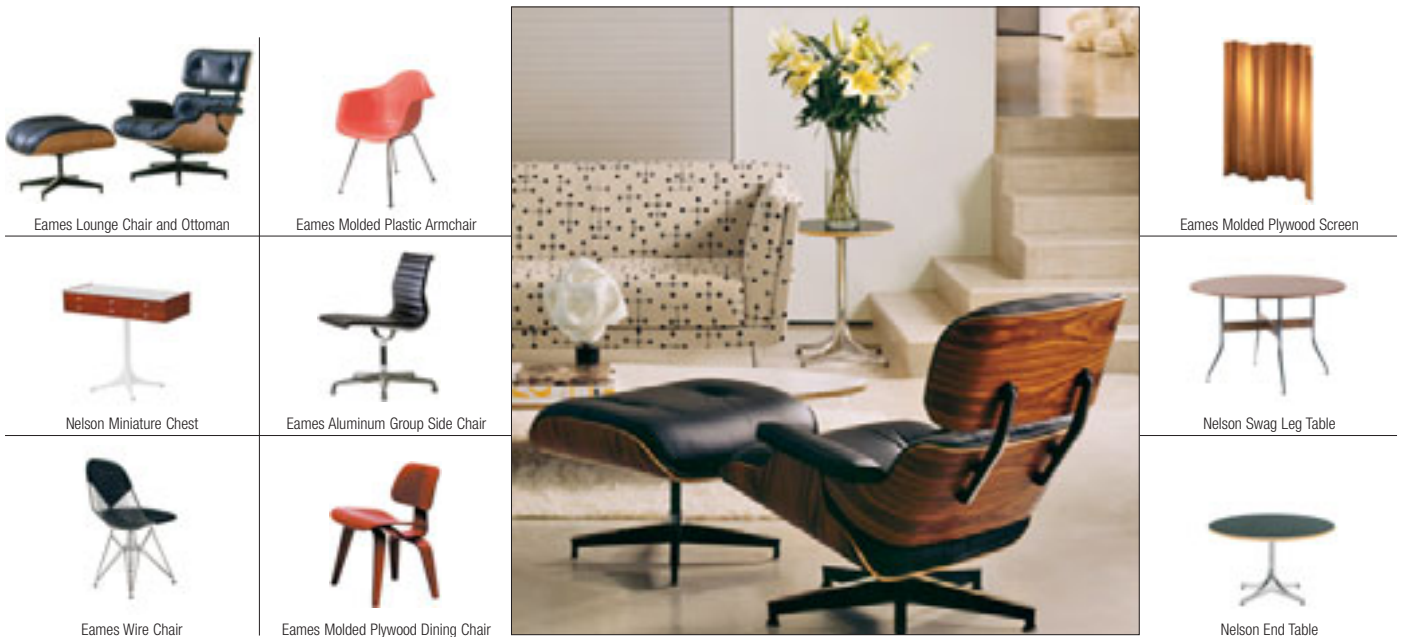
The products above are among the original modern classics still manufactured today and available through Herman Miller.

The intervening years saw the lounge chair's introduction in 1956 on the "Today Show" and its transformation into a modern design icon, a lofty achievement for a chair that Charles hoped would simply have the "warm receptive look of a well-used first baseman's mitt."