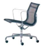
Eames Aluminum Group Management Chair