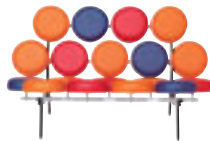
Nelson Marshmallow Sofa